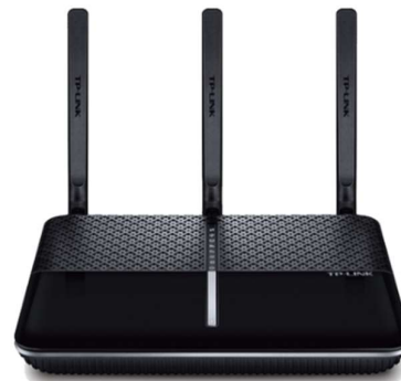
TP Link Archer 5